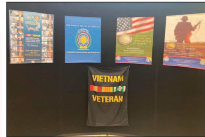
The welcoming display of the event at the NASJRB Commissary.